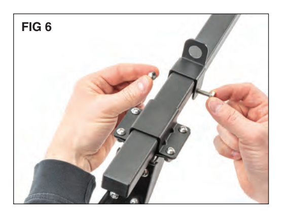
Attach the optional tie down loop to the crossbar with a hex bolt and nylock nut. (FIG6)