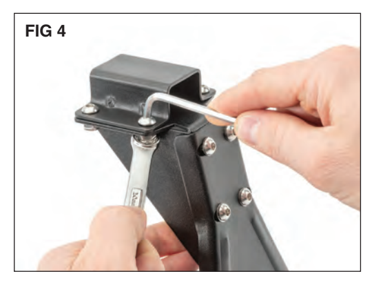
Using a 4mm hex key and a 10mm wrench loosely bolt the retaining straps to the pedestal with 4 button head screws and 4 nylocks. (FIG4)