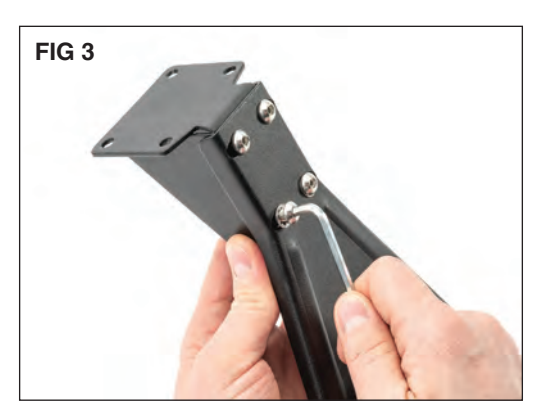
Attach the pedestal to the upright with 4 button head screws and 4 star washers with a 4mm hex key. The pedestal height is adjustable, make sure to mount all 4 at the same height. (FIG 3)