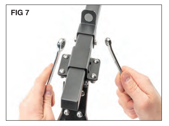
Tighten in the desired position with (2) 10mm wrenches. (FIG7)