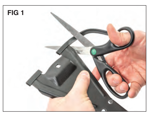
Put on safety glasses. Locate the 4 rack uprights and the rubber chafe strip. Use scissors to cut the chafe strip into pieces and fit them on the feet of the upright. (FIG1)