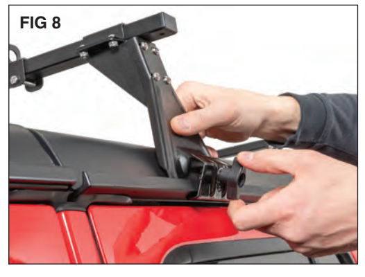
Place the rack on top of the vehicle and position the uprights into the drip rail on either side of the vehicle.

Take care to place them in the same position on both sides. Snug the clamp against the outside of the drip rail with the hand knob. Position second rack and repeat installation. At this point even the spacing of the crossbar in the uprights and fully tighten the retaining strap bolts with a 4mm hex key and 10mm wrench.