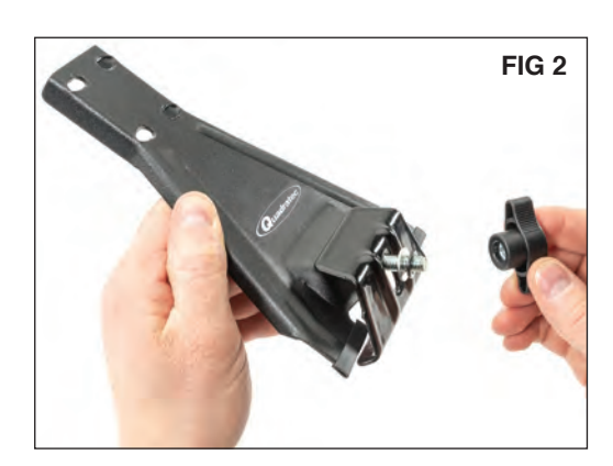
Loosely attach the vinyl coated clamp to the upright with a carriage bolt, flat washer, lock washer and hand knob. (FIG2)