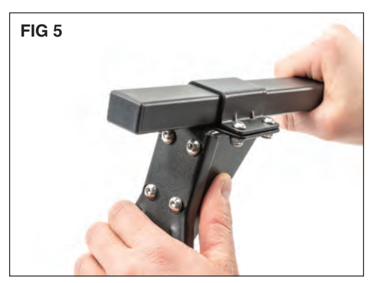
Slide the cross bar through the upright and retaining strap. Repeat on opposite end. (FIG5)