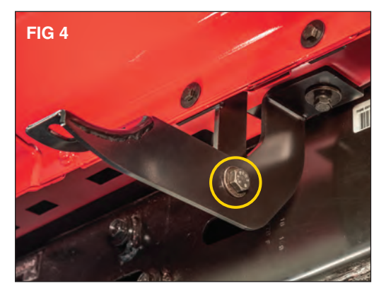
Next align the mounting slots between the two brackets and loosely install a 10mm bolt (A) with washers (G) on both sides and secure with a 10mm nylock nut (E) using a 16mm hex wrench and a 17mm socket. (FIG 4)