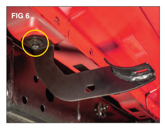
Align the hole in the step mounting bracket (PC) and loosely install using a 8 x 35mm bolt (B), lock washer (J) and flat washer (H). (FIG 6)