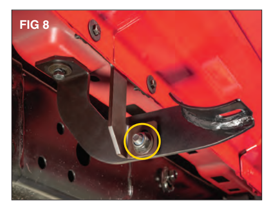
Next align the mounting slots between the two brackets and loosely install a 10mm bolt (A) with washers (G) on both sides and secure with a 10mm nylock nut (E) using a 16mm hex wrench and a 17mm socket. (FIG 8)