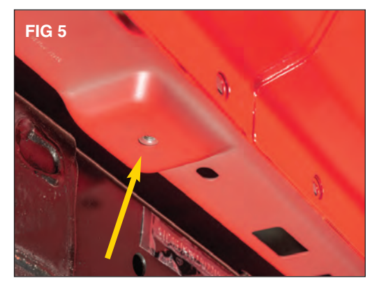
At the rear of vehicle locate the vertical threaded hole behind the pinch weld. (FIG 5)