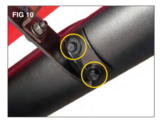
Loosely install the 8mm bolt with captive washer (D) using a 13mm socket. (FIG 10)