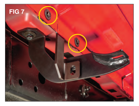
Locate and loosely install the rear support bracket using 6mm hex head bolts (B) through the pinch weld with washers (I) on both sides and secure with a 6mm nylock nut (F) using a 10mm hex wrench and a 10mm socket. (FIG 7)