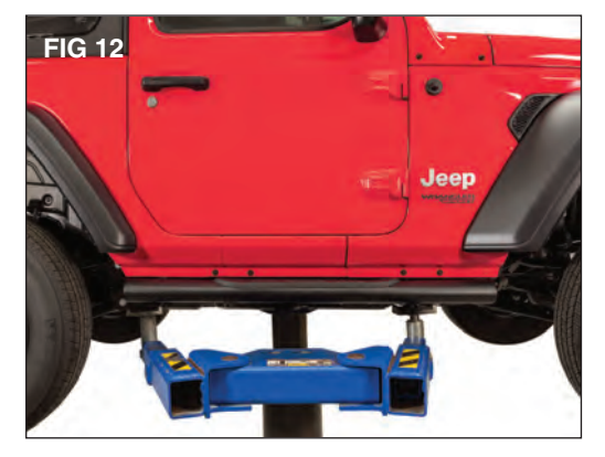
Now tighten the 10mm hardware securing the brackets to each other. Lastly tighten the 8mm captive washer bolts to tube step. Each bolt is tightened to the Torque Specs show below.