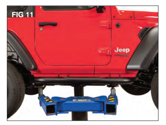
Ensuring that the step is level to the body, slowly tighten the 8mm bolts behind pinch weld on the front and rear mounting brackets. Next, tighten all 6mm hardware so the support brackets are on center with pinch weld holes.