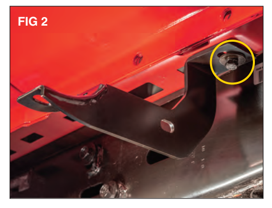
Align the hole in the step mounting bracket (PF) and loosely install using a 8 x 35mm bolt (B), lock washer (J) and flat washer (H). (FIG 2)