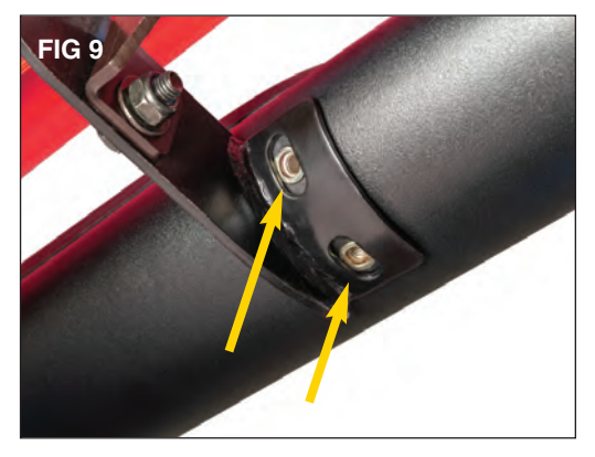
Now align the step with mounting bracket holes as shown. (FIG 9)