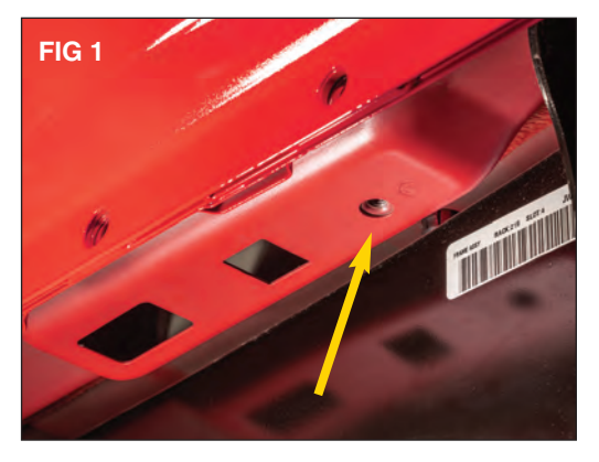
Put on safety glasses. Starting at the front of vehicle locate the vertical threaded hole behind the pinch weld. (FIG 1)