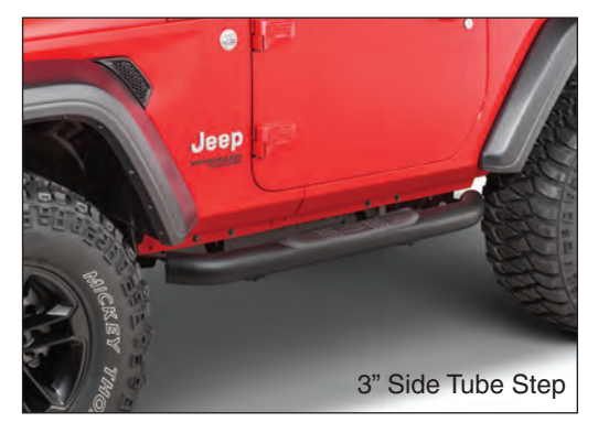
Your Tube Steps have been designed and manufactured to provide years of use. However, like any product, general maintenance is required to keep it looking new.