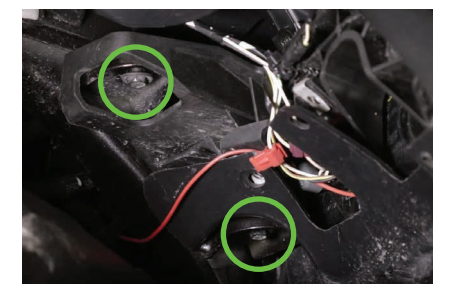
5. Pull the fender liner back to gain access to the DRL/sidemarker bracket. Remove the three T27 bolts and loosen the two 10mm bolts holding the bracket in place.