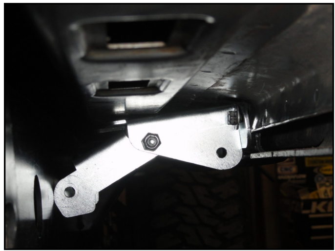
FIGURE 4 FIGURE 5