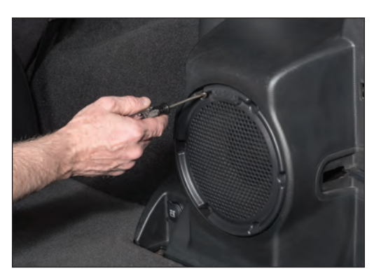
Using a T20 torx driver remove the 6 screws from the factory subwoofer grill.