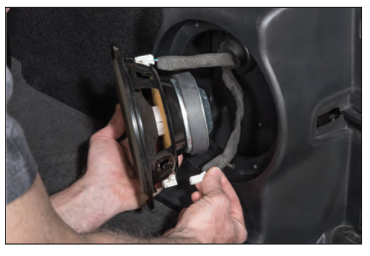
Remove the grill and factory subwoofer. Disconnect the two connectors from the woofer.