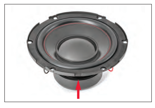
Locate the smaller ¾" notch in the speaker chassis (shown). Note: This notch MUST be positioned at the six O'clock position in the speaker housing.