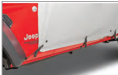
Protects Door Openings