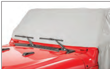
Keeps the heat out!