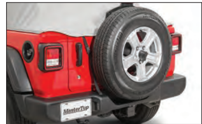
Easy on, Easy Off!