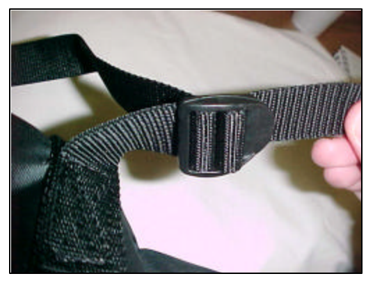
Page 2 of 3

NOTE : Do not over load the Auto Back Pack. The Standard capacity is 20 cubic feet and 30 cubic feet for the large Auto Back Pack. Refer to you owners manual to determine the weight capacity of the vehicles rooftop.