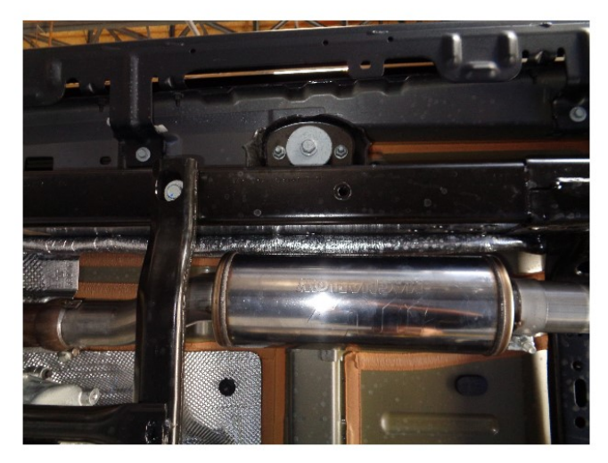
Step 3: Begin installation of your new MAGNAFLOW system by attaching the Resonator Assembly to the catalytic converter outlet using the OEM clamp. Engage the welded hanger to the rubber insulators. Keep all fasteners and clamps loose until final adjustment.

MAGNAFLOW: 1901 Corporate Centre Dr - Oceanside, CA 92056 | 1(800)990-0905 Technical Support: 1(800) 959-9226 | Email: moreinfo@magnaflow.com