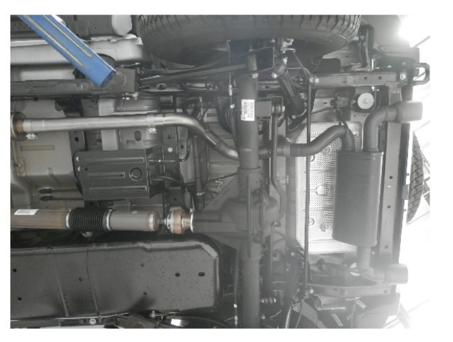
Step 5: Next loosely install the Over-Axle and Muffler Assemblies using the supplied clamps. Locate all welded hangers to the rubber insulators.