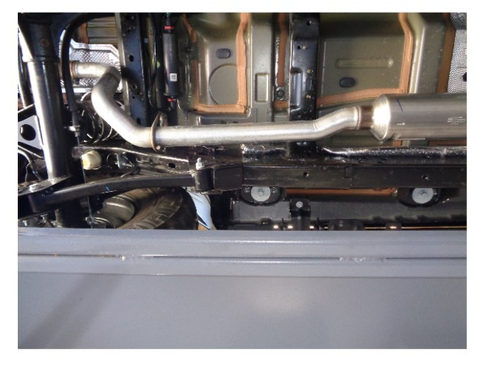
Step 2: With the system supported, working front to rear disengage the hangers from rubber insulators and remove the OEM system. Do not discard or damage the clamp or rubber insulators as they will be used to install the new system.