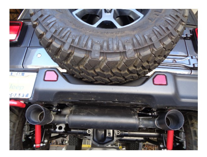
Step 6: Once a final position has been chosen for the new exhaust system, evenly tighten all clamps from front to rear using the torque specifications on page one of these instructions. Inspect all fasteners after 25-50 miles for operation and re-tighten if necessary.

MAGNAFLOW: 1901 Corporate Centre Dr - Oceanside, CA 92056 | 1(800)990-0905 Technical Support: 1(800) 959-9226 | Email: moreinfo@magnaflow.com