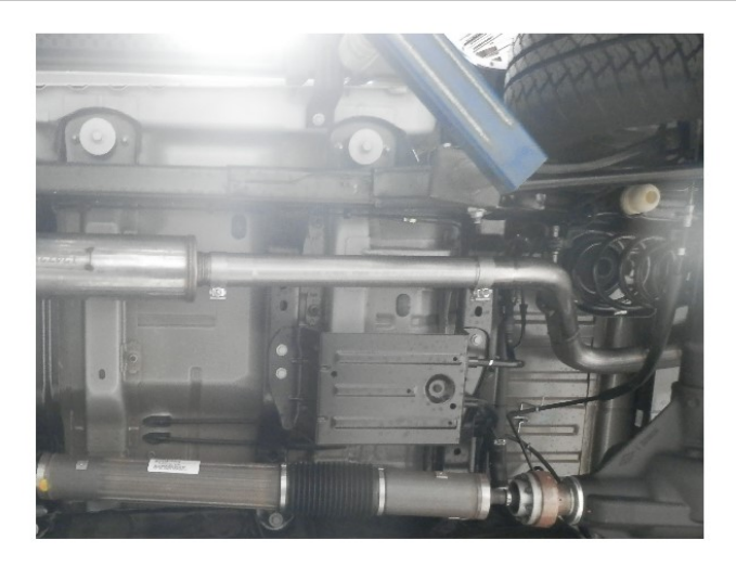
Step 4: The included Extension Pipe is required for the four door model only. It is to be installed between the Resonator Assembly and the Over-Axle Pipe. if you have the two door model this pipe may be discarded.