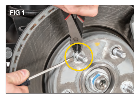
If present, remove brake drum or rotor disc retaining clips using a flat blade screwdriver & diagonal pliers. (FIG1)

To begin, put on safety glasses. Remove the first wheel and tire per the vehicle's owner's manual.