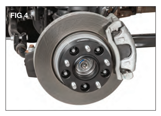
Slide wheel spacer and or adapter on to wheel studs as shown. (FIG4)