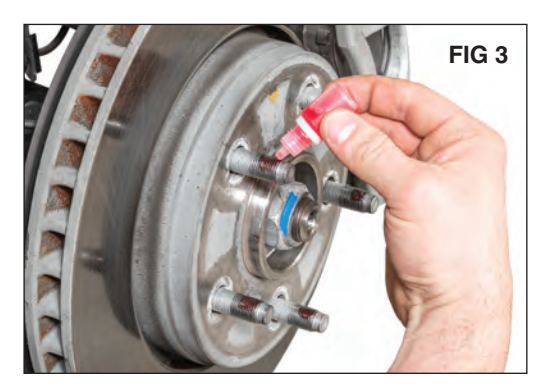
Apply the provided thread locker to the original wheel studs as shown. (FIG3)