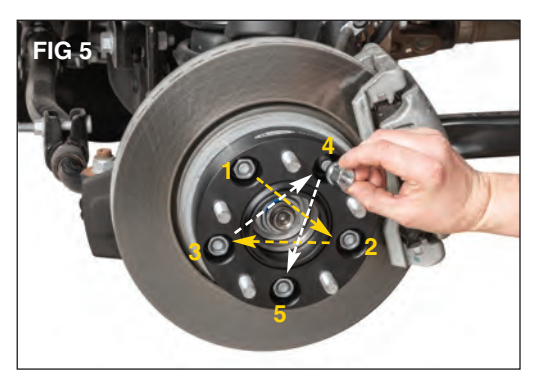
Install the supplied lug nuts as shown with tapered seat facing inward. Run the lug nuts on as much as possible by hand in a star pattern. NOTE: Do Not Use a Impact Gun. (FIG5)

Finally, using the original lug nuts, install your factory wheel and tire.