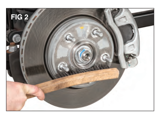
Thoroughly clean wheel studs, hub area, brake drum and or rotor disc using a wire brush. (FIG2)