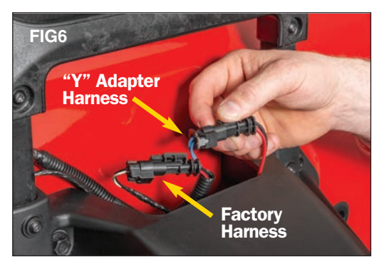
Connect original factory harness to the "Y" harness. (FIG 6)