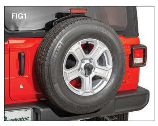
Remove the spare tire per your vehicle's owners manual. (FIG 1)