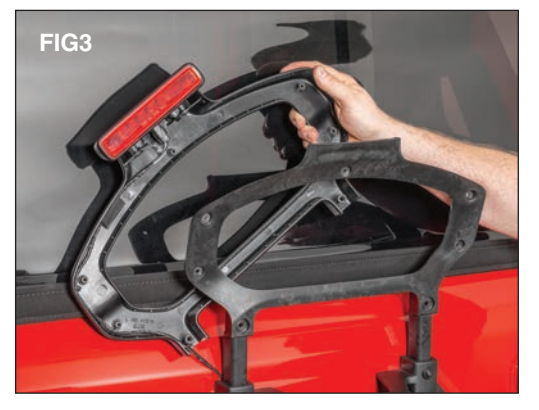
Separate the housing to expose the wiring harness and unplug the factory connector from the back of the brake light. (FIG 3) Set the 3rd brake light aside.