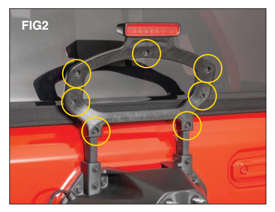
Remove the 7 screws holding the 3rd brake light bracket together using a T-25 Torx driver. (FIG 2)