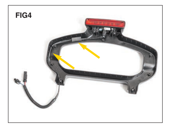
Route and secure the "Y" harness into the channel on the backside of the brake light just as the original harness was. (FIG 4) Connect to the original 3rd brake light.