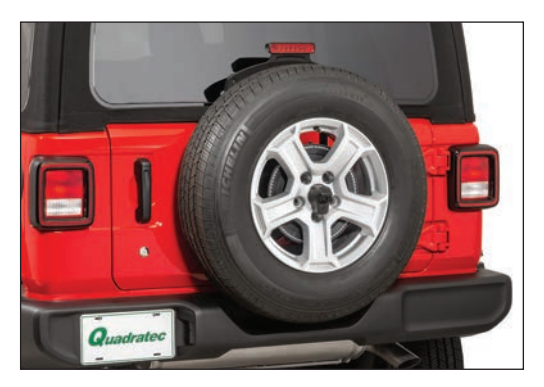
PARTS LIST: LED 3rd Brake Light Ring - QTY 1 "Y" Adapter Wiring Harness - QTY 1