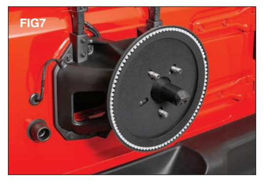
Place the third brake light ring over the studs as shown and plug into the "Y" harness. (FIG 7)

Reinstall the spare tire and secure it per vehicles owners manual.