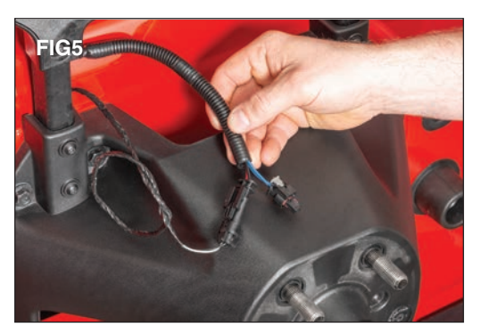
Reinstall the brake light & "Y" harness to bracket using the original hardware removed in figure 2. Be careful not to pinch any wires. (FIG 5)