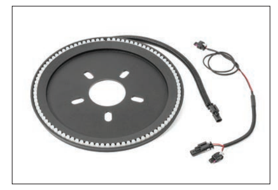
REQUIRED TOOLS: Safety Glasses Lug Wrench & Socket T25 Torx Driver or Bit