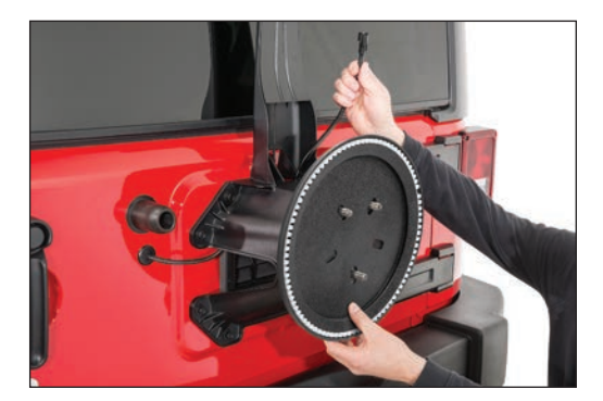
Place the third brake light ring over the studs on the tire carrier as shown with the attached harness located at the bottom of the ring. You may temporary secure the brake light ring by finger tightening one of the lug nuts on to the tire carrier studs.