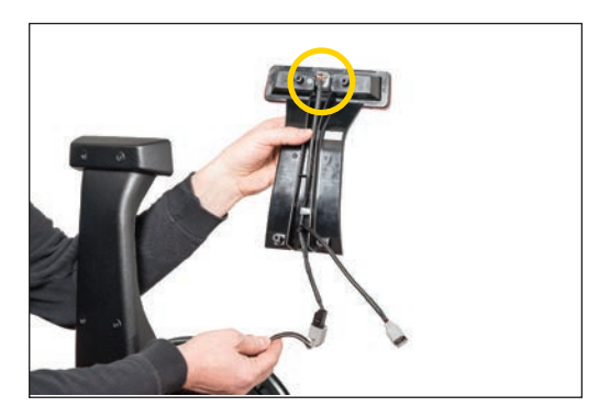
Now plug one end of the "Y" harness into the back of the factory brake light. Once again make sure the connectors fully engage and lock together.