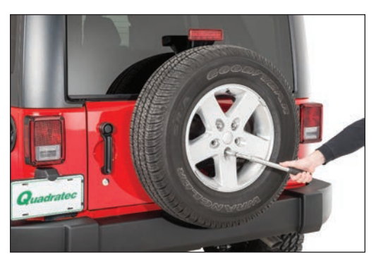
Put on safety glasses. Remove the lug nuts that secure the spare tire using lug wrench and correct socket (factory lug nuts use ¾" socket). Carefully remove