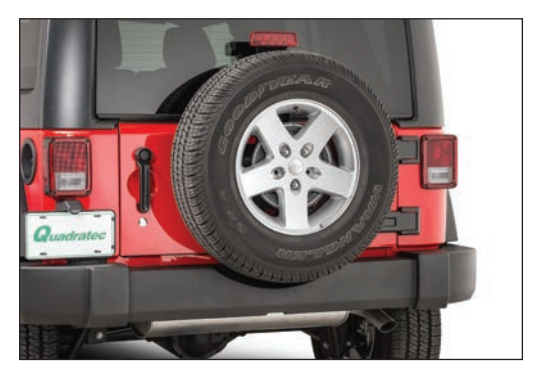
Close the tailgate and reinstall the spare tire and secure it with the 3 lug nuts. Tighten by hand and do not use an impact gun. This could overtighten the lug nuts and damage the 3rd brake light ring.

Check brake lights for proper operation before driving the vehicle.