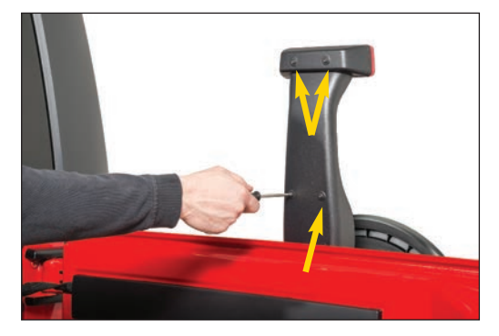
Open the tailgate of the vehicle and locate the 4 T20 screws on the backside of the factory 3rd brake light housing. Remove the 4 screws with a T20 torx driver.