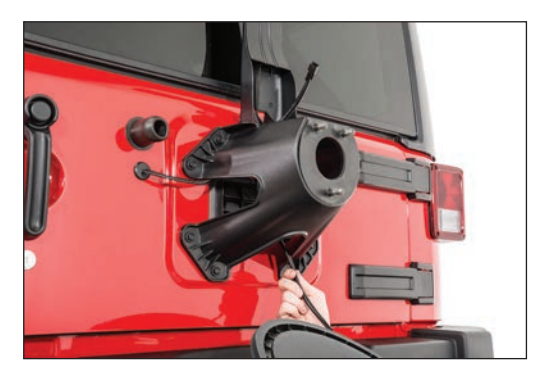
the spare tire. Pass the connector and harness from the third brake light ring behind the spare tire carrier and out the top.