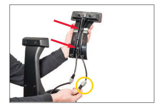
Route and secure the "Y" harness into the channel on the backside of the brake light. Use the same routing and securing clips that the factory harness used. Connect the other end of the "Y" harness to the brake light ring harness.