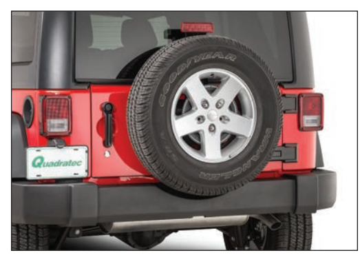
PARTS LIST: LED 3rd Brake Light Ring - QTY 1 "Y" Adapter Wiring Harness - QTY 1