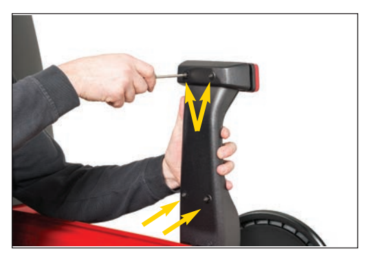
Reinstall the factory brake light into the tire carrier housing. Be careful not to pinch any of the wires while reinstalling. Reinstall the 4 T20 screws with a Torx driver.