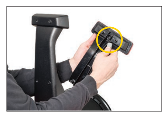
Remove factory brake light from the housing and unplug the factory connector from the back of the brake light.