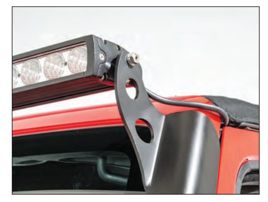
Install washer, split washer, and nut (supplied with lightbar) on both sides.