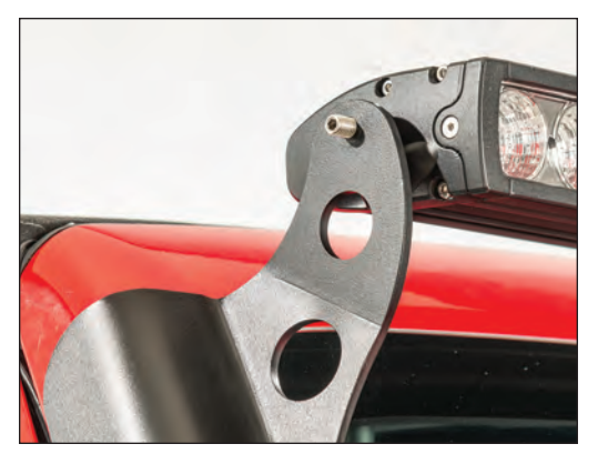
spacer on both ends. Carefully insert the stud through the hole in the bracket on the passenger side.