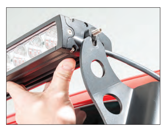
Drop the stud on the driver's side down into the slot.