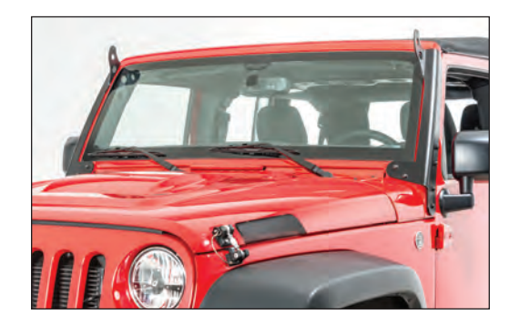
Repeat this step on the passenger side of the vehicle.