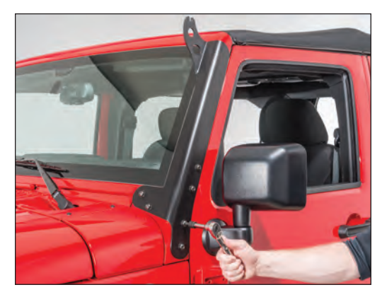
Place the bracket over the hinge plate and align the holes on the bracket with the holes in the factory hinge plate. Reinstall the 6 T40 torx bolts lightly with at T40 torx bit and ratchet but do not fully tighten at this time.