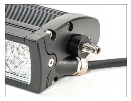
Install the studs (supplied with light bar) into the ends of the light bar. Snug with a 4mm hex and install the supplied