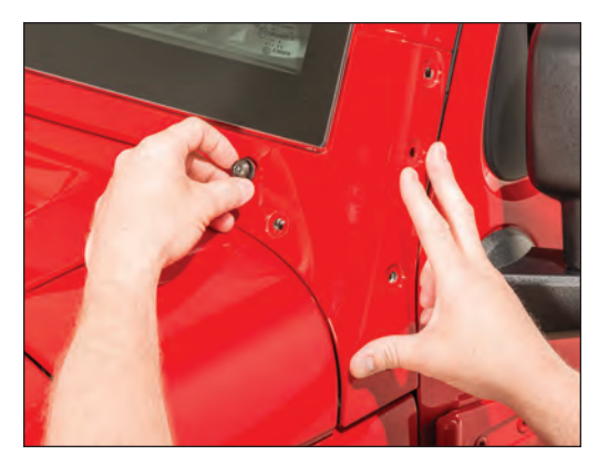
and ratchet. Retain bolts for reassembly and be careful not to drop the hinge plate after the bolts are removed.