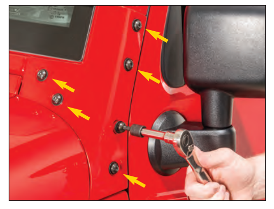
Put on Safety Glasses. Locate the 6 T40 torx bolts on both windshield hinges. Remove all 6 bolts using a T40 Torx bit