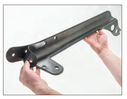
Locate Driver and Passenger side brackets and place the corresponding gasket on the backside of the bracket.