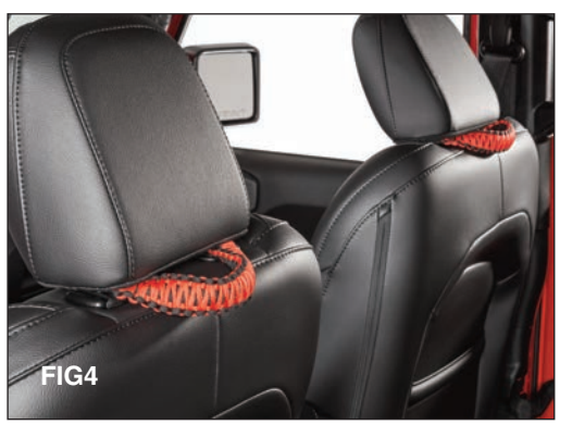
Repeat process for opposite side of vehicle from which you started. (FIG4)