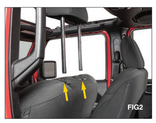
Recline both front seats. Depress both headrest buttons at the same time on one of the front seats and pull up to temporarily remove headrest. (FIG2)