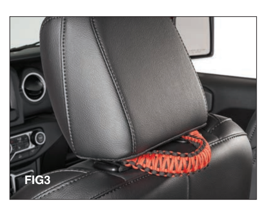
As shown in FIG3, slip each headrest post though each grab handle grommet and reinstall headrest as shown.