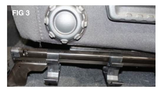
Locate the 2nd bracket far enough back to accommodate your flashlight. (FIG 3)