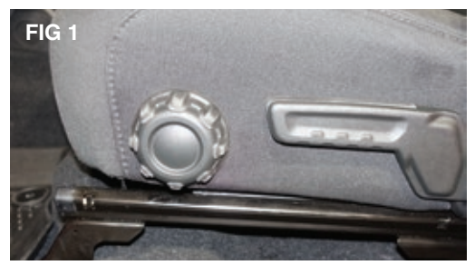
Put on safety glasses. Open the driver or passenger door of your Jeep. Locate the seat slider. (driver side shown) (FIG1)