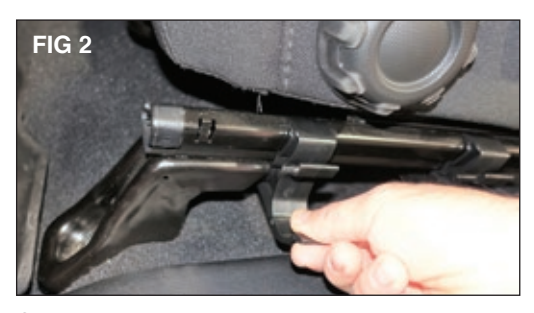
Snap the light bracket to the seat slider as shown. Slide the front bracket as close to the front of the seat as possible. (FIG 2)