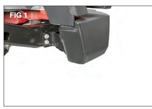
Put on safety glasses. Remove the rear wheel & tire per vehicle's owners manual to gain rear bumper access. (FIG 1).