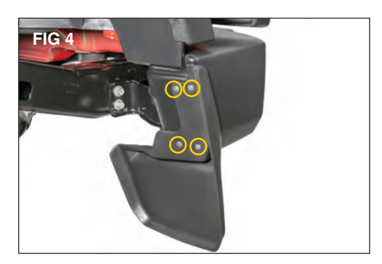
Install the 4 screws into the 3/32" holes (FIG4). Do not over tighten.