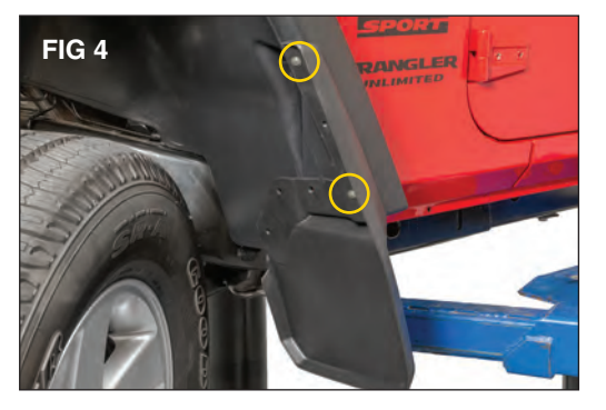
Mount the splash guard to fender flare using two screws into the U nuts. (FIG 4).