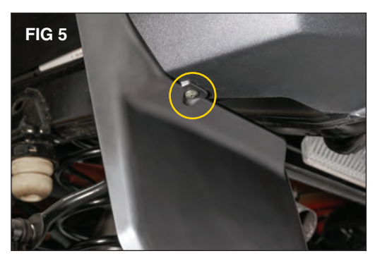
Next, drill final hole underneath using a 3/32" drill bit and install final screw. (FIG 5). Do not over tighten.