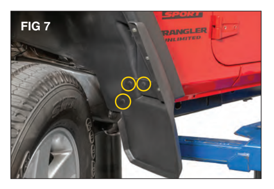
Install three plastic rivets through splash guard and into wheel liner. (FIG 7) Repeat all steps for other side of the vehicle.