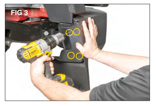
While holding the splash guard in place on the bumper drill 4 holes through the splash guard into the bumper using a drill and 3/32" drill bit. (FIG 3).