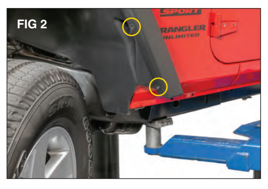
Using diagonal cutting pliers remove the two plastic rivets from the fender flare shown (FIG 2).