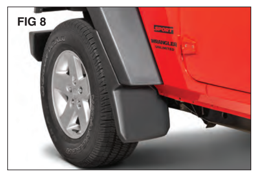
Front Installation is now complete.