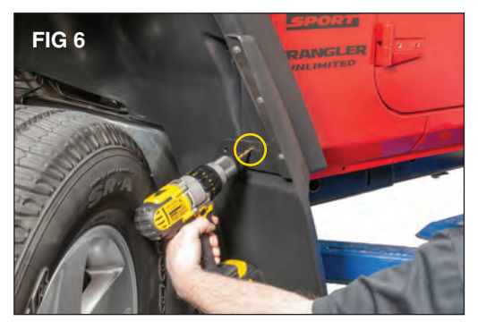
Lastly locate the 3 holes in the splash guard and drill through it and into the wheel liner using an electric drill and \frac{1}{4} " drill bit. (FIG 6).