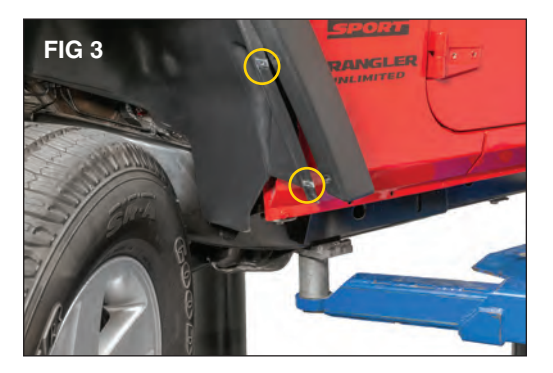
Install the supplied U Nuts on to inner wheel liner in the locations from the two previously removed plastic rivets.(FIG 3).