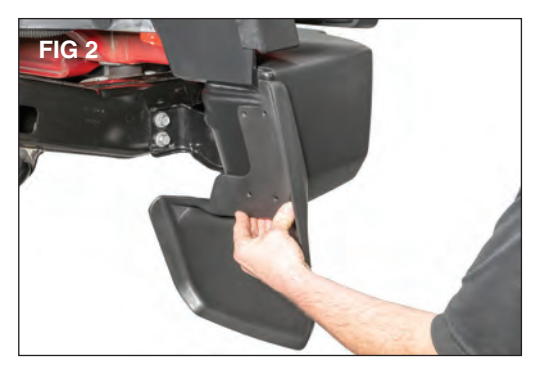
Line up the splash guard to rear bumper as shown. Take care to line up the edge of splash guard with the edge of the rear bumper. (FIG 2).