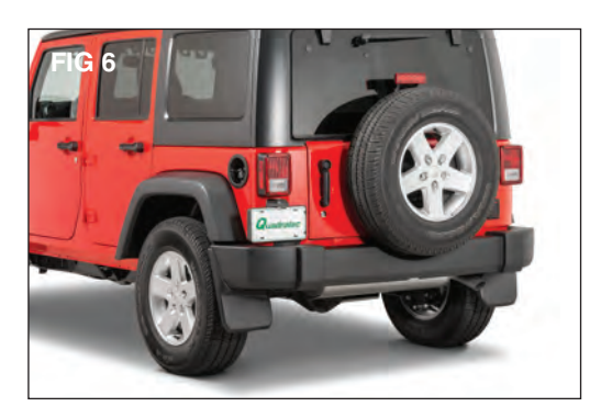
Repeat all steps for other side of the vehicle. Rear Splash Guard Installation is now complete.