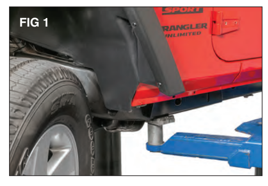
Put on safety glasses. Start the vehicle and turn the wheel to gain access to inner wheel liner. (FIG 1).