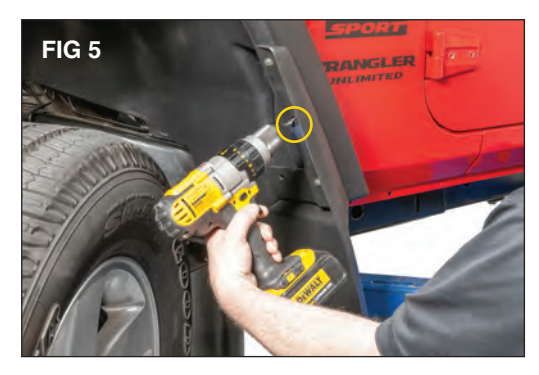
Locate the middle hole in the splash guard and drill through it and into the fender flare using an electric drill and 3/32" drill bit. (FIG 5). Install a screw through splash guard and into fender flare. Do not over tighten.