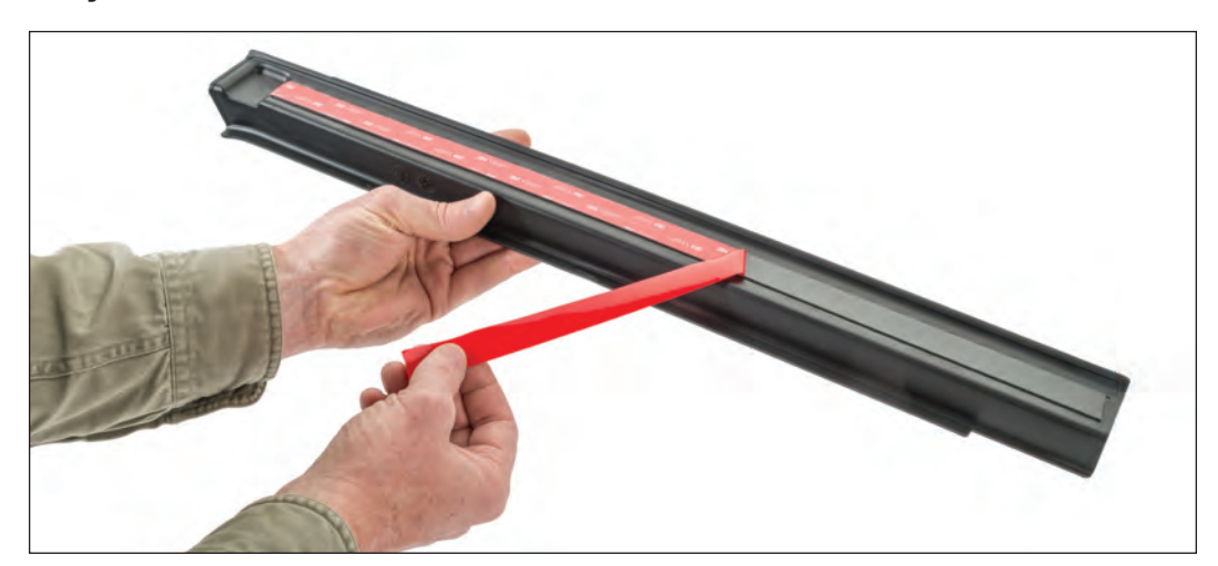
Step 2: As shown above, remove the adhesive backing from front entry guard. Peel the plastic tape strip backing to reveal the adhesive surface.