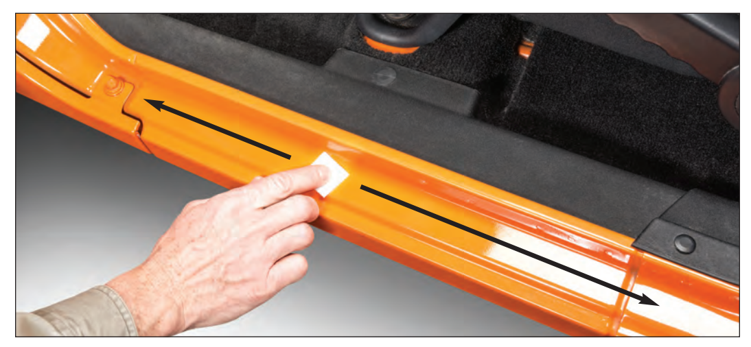
Step 1: Clean threshold contact area with an alcohol prep pad. Remove one alcohol prep pad from its packet and wipe the entire contact area with the

Note that each entry guard is mold marked on the back side with its proper location.